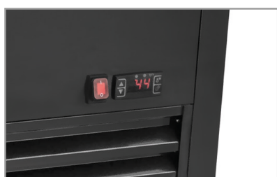
Termostato elettronico Electronic thermostat

Vetrina refrigerata ventilata. Ventilated refrigerated cooler