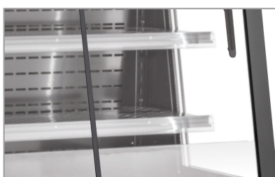
Mensole regolabili e inclinabili Adjustable and tiltable shelves