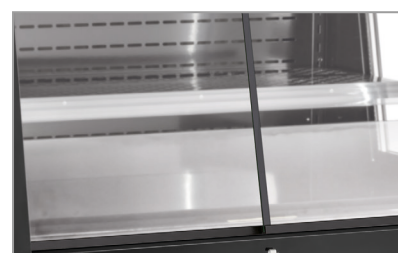
Superficie interna in acciaio AISI 304 AISI 304 Stainless steel inner liner