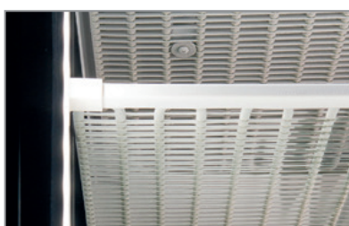
6 Mensole refrigerate 6 Refrigerated shelves