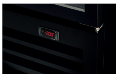
Termostato elettronico Electronic thermostat