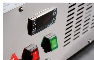
Termostato elettronico Electronic thermostat