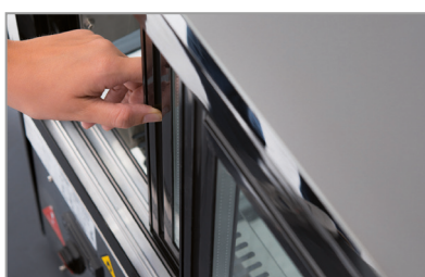
Porta scorrevole Sliding door