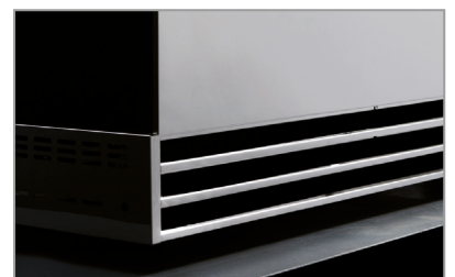
Esterno acciaio specchiato, vetro lucido nero Body mirror stainless steel, black shiny mirror