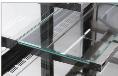
Ripiani: vetro temperato, frontale acciaio Shelves: tempered glass, stainless steel front

Banco pasticceria quattro lati vetro ventilato, porte scorrevoli. 2 Ripiani. Ventilated positive four-sided glass pastry bench, sliding doors. 2 Shelves.