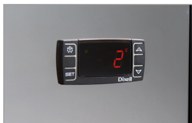
Termostato elettronico Electronic thermostat